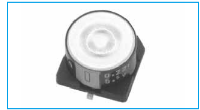
Marking color : White print on an brown sleeve