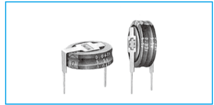
Marking color : White print on a black sleeve