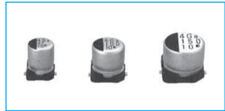
Marking color : Black print (φ3×5.3L—φ8×10L) White print on a brown sleeve (φ10×10L)